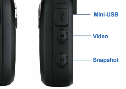
Table 1.1 Buttons