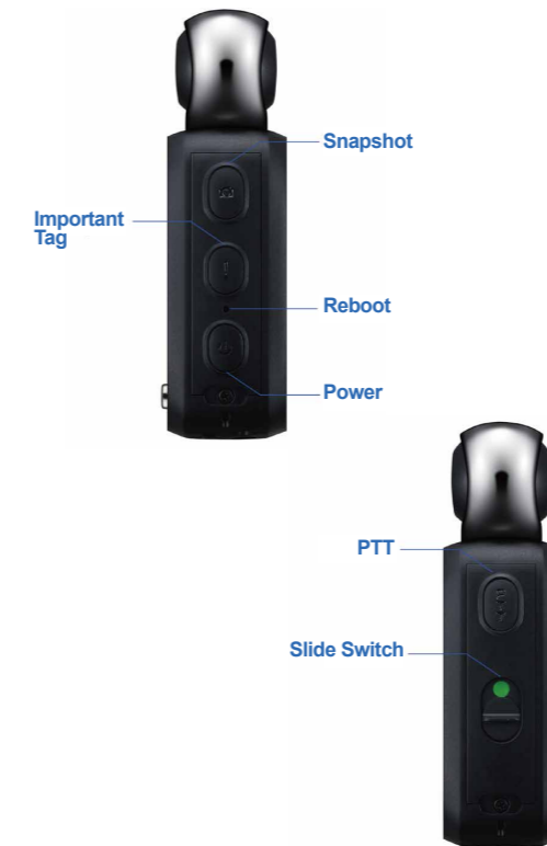
Table 1.1 Button & Switch